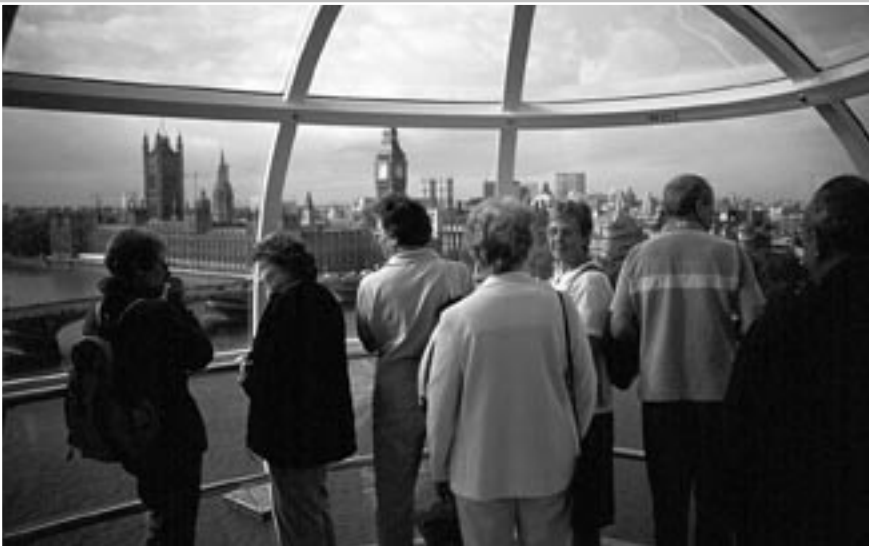
Looking out over the Houses of Parliament, TADS members enjoy one of London's most popular attractions: The London Eye. Once again the weather was kind to us!!