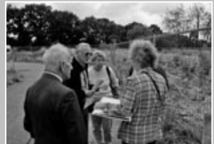
Closer to home, TADS is keen to research recent local history. Here members, on a walking tour of Tadley, study the remains of World War II buildings in and around the town.