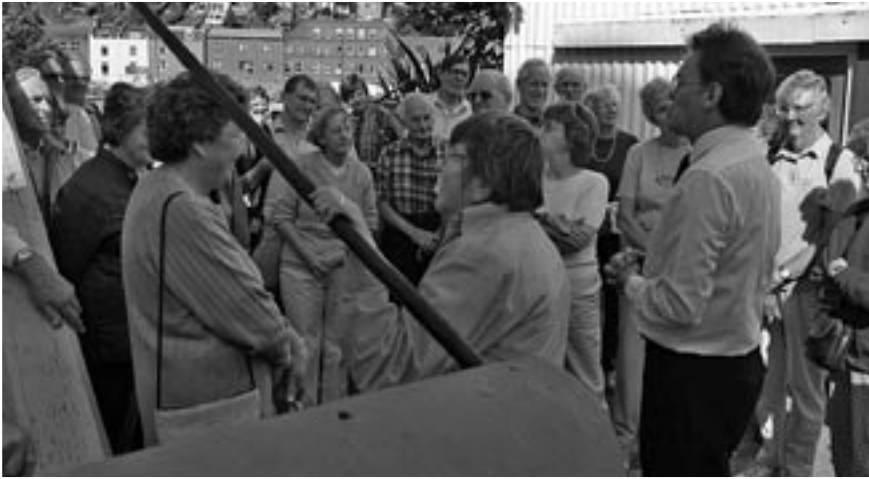
A glorious day for the trip to see Isambard Kingdom Brunel's Great Western in Bristol. Much to do and see, TADS members listen as the guide explains the history and restoration of the ship.

As well as the regular monthly meetings, one of the main events of the TADS calendar has been the 'annual trip' in September. Over the years members and their guests have visited a wide range of diverse and interesting places throughout the south of England. As well as the 'annual trip' there have also been many other interesting 'one-off' outings.