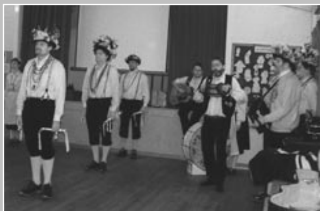
Basingclog Morris Group 'tripping the light fantastic' in 2003. For an evening St Pauls' Church Hall became a world of brightly coloured costumes, joyful music and the crash of clogs on the wooden floor!