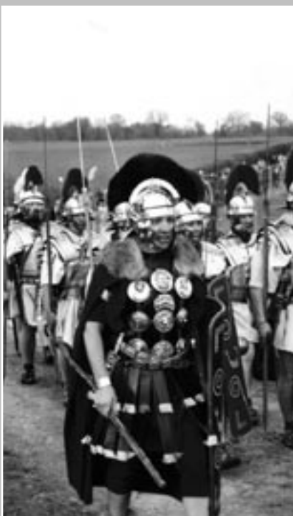
Members of the 2nd Augusta (Roman) Legion re-enactment group at Calleva Atrebatum (Palm Sunday 1994). The Legion visited a TADS meeting in March 1993.