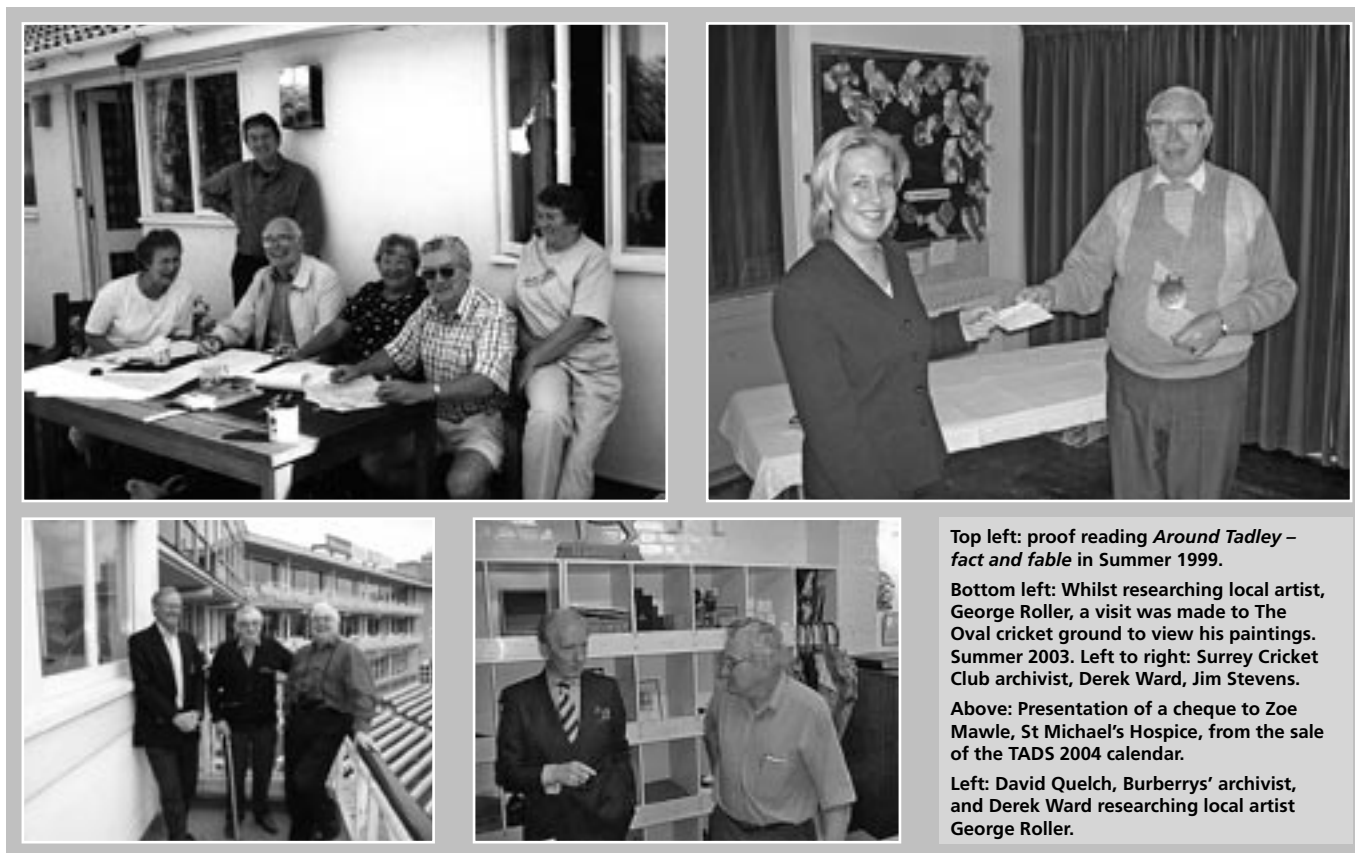
Top left: proof reading Around Tadley – fact and fable in Summer 1999.

In addition to the monthly talks held at St Paul's Hall, The Green, TADS has a very active project group which meets regularly to discuss and consolidate the research for current and long term projects. It is not always as dry and studious as it may sound. A few glasses of wine or beer have been known to pass lips!!