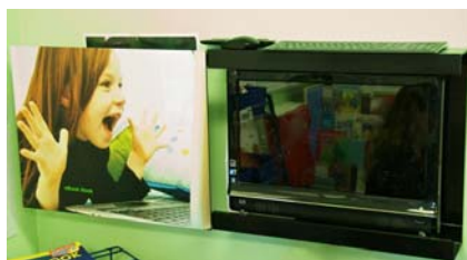
Figure 2. E-book nook Design.