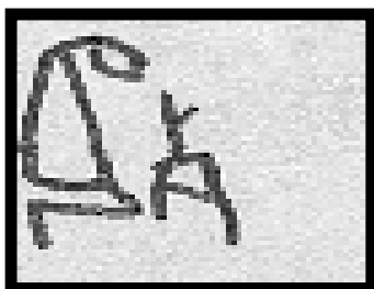
Figure 1. The ancient Chinese character: Death

Based on the above observation, we began to study people’s drawings of their personal conception of their own death. Study on death images or metaphors is not new in thanatological literature. Ross & Pollio (1991) proposed that death metaphors may relay death concepts that are difficult to convey by spoken languages and that can better reveal