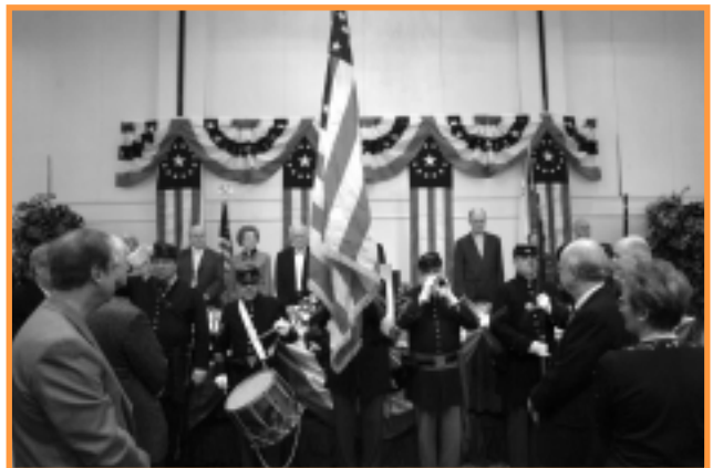
The 114th Illinois Volunteer Infantry Regiment (Reactivated) presents the colors.