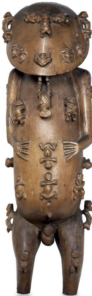
Fig.1 A'a, Rurutu, Austral Islands.

chapel. Williams sent the remaining one, together with a local 'fisherman's god' and the A'a back to the UK (Williams 1838: 99).