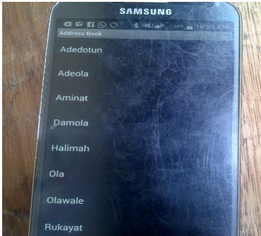
Figure 1.7: Result Output

Figure 1.6 and 1.7 are the output information that will be displayed after saving the contact to each field. As the mobile phone user click on any of the name, the information that is already saved in the SQL LITE database will be displayed for easy retrieval