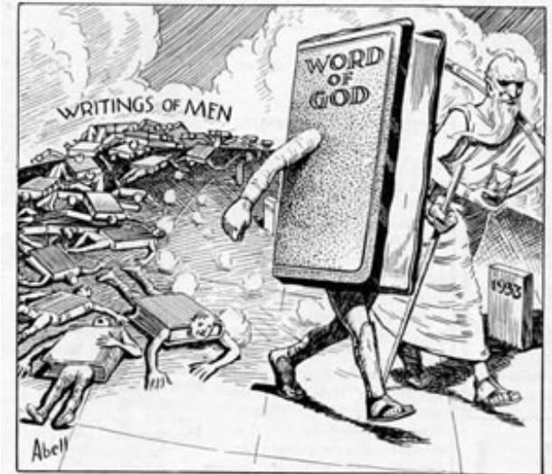
The Word of God shall stand forever—Isaiah 40:8