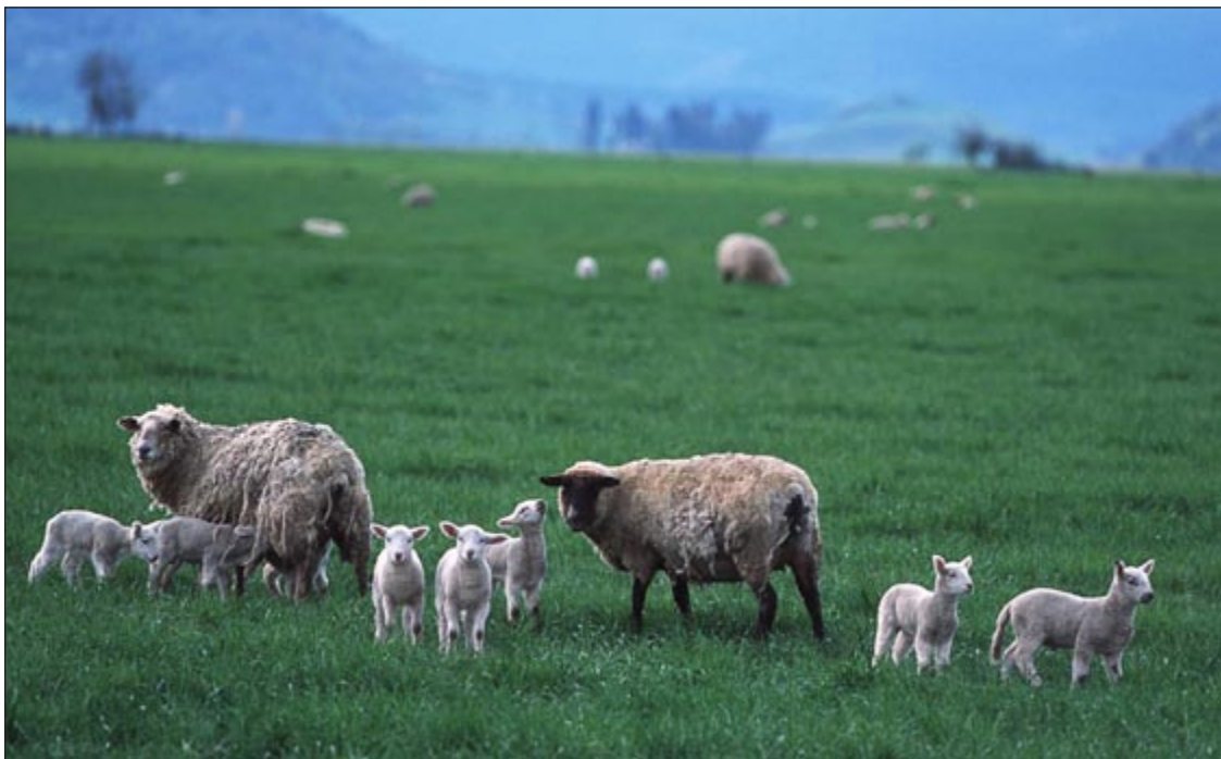
Ewes and lambs on pasture in Linn County, Oregon.

A s alternatives to industrial agriculture evolve, so must their markets and the farmers who serve them.