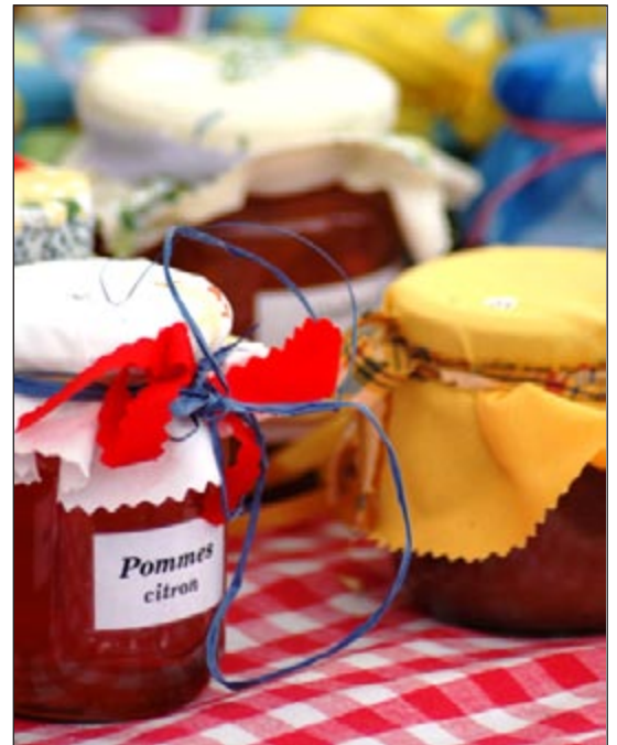
Jam processed on-farm is one example of a value-added product.

throughout the world, the vision of sustainable agriculture’s futurists is small to mid-size diversified farms supplying the majority of their region’s food. (No one in Idaho has to give up orange juice, and there will still be cranberries in California for Thanksgiving.)