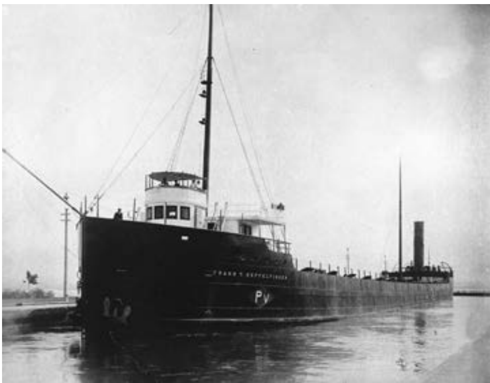
The 1902 built Frank T. Heffelfinger, sailing as a grain carrier for the Peavey Company, escaped a possible sabotage attack during the 1909 strike.

suspected ship to find out the engineer's name. They duly passed along the identity to the appropriate local who then hunted down the offender for interrogation and punishment. 63