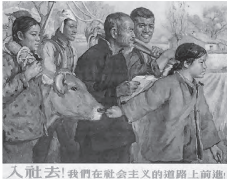
Figure 3: "Go Towards the Communes! We Are Forging Ahead on the Socialist Road!" (Zhang Wenxin, 1955).