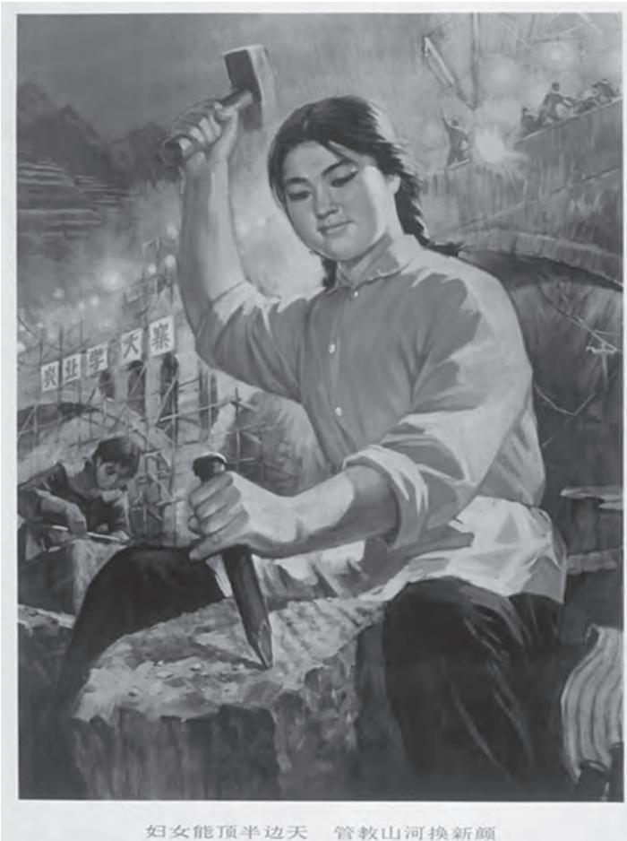
Figure 2: "Women Can Hold up Half the Sky; Surely the Face of Nature Can Be Transformed" (Wang Dawei, 1975).

Five-Year Plan, and the Great Leap Forward; and "Campaigns 1966–1976," which is mostly about the Cultural Revolution. Other useful categories include "Models and Martyrs," "Villains," and "Iron Women, Foxy Ladies," which focuses on the contradictory images of women in posters. The site is academic, "a platform for the presentation of authentic documentary and historical information without the aim to propagate or dispute any political views." It is nonprofit and does not sell poster art. Digital use of the posters for noncommercial, private, educational, or scholarly/scientific purposes is allowed, with notification.