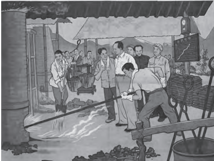
Figure 4: "Chairman Mao Visits a Homemade Blast Furnace" (Zhou Xuefen and Yin Quanyuan, 1958).

The relative success of the 1955–1956 agricultural collectivization convinced Mao that China could be driven further and faster. Industrialization had been a constant poster theme beginning in 1949, and views of factories, workers, and blast furnaces were ubiquitous. During the Great Leap Forward (1958–1961), an effort to double steel production in a single year gave rise to "backyard blast furnaces," one of which is shown in Figure 4 with Mao (in shirtsleeves due to the heat) observing the production.