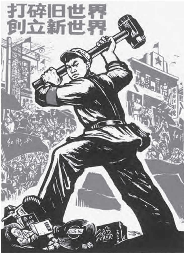
Figure 6: "Destroy the Old World; Establish the New World" (1967).