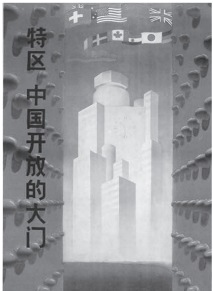
Figure 8: "Special Economic Zones—China's Great Open Door" (Sun Yi, 1987).