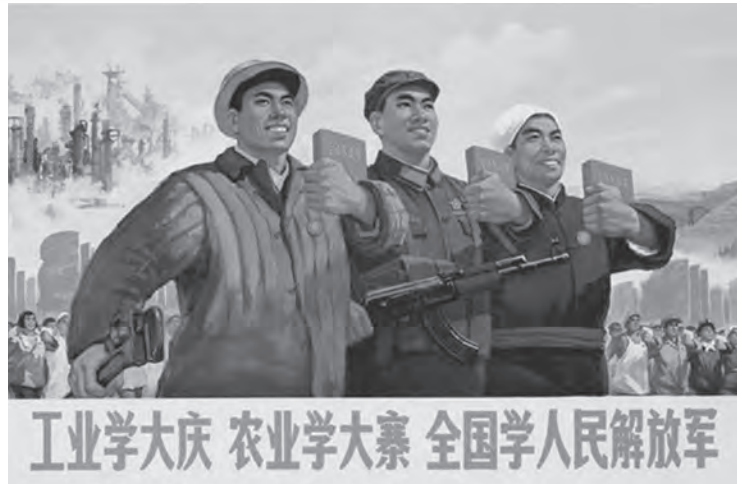
Figure 7: "Industry Learns from Daqing, Agriculture Learns from Dazhai, and the Whole Country Learns from the People's Liberation Army" (1971).

In the ten years I have been using propaganda posters to teach about the Maoist period in China, student reactions have been highly positive,