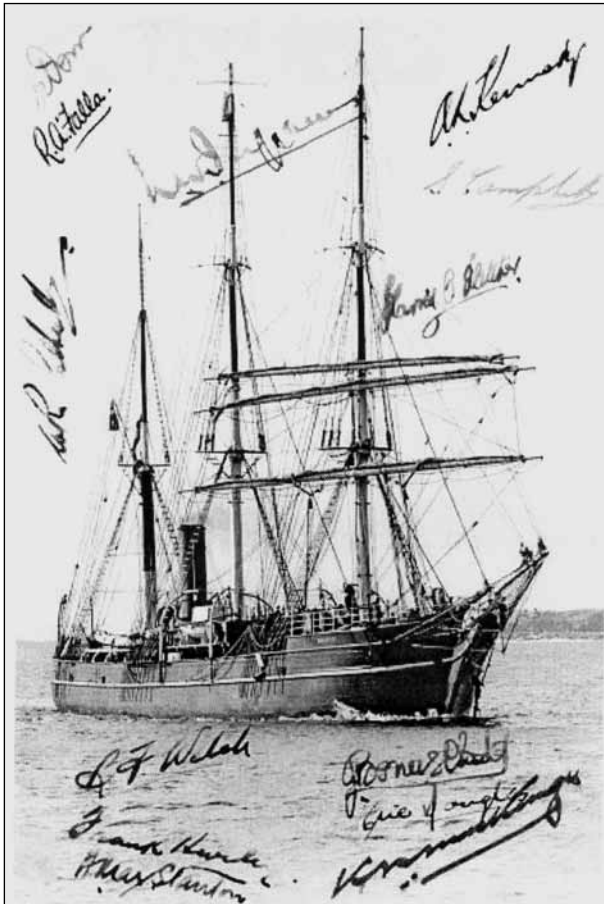
FIGURE 3 A souvenir sheet of RRS Discovery in the Derwent River, Hobart, on return from the BANZARE Expedition in 1930. Dr William Wilson Ingram's signature is at the top of the main mast of the steam barque.

where rabbits and sledging dogs left by former whalers and sealers had wreaked ecological havoc. 18 On 12 January 1930 the expedition landed at Cape Batterbee on the northern tip of Antarctica, where Mawson recorded: