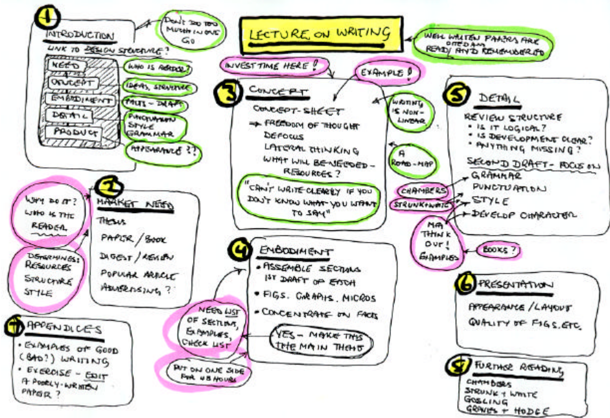
Figure 3. The concept sheet I made when writing this text.