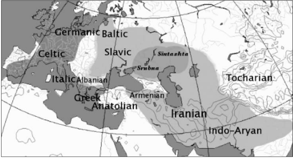
Figure 2. Bachmann's [6] map of Kentum and Satem languages

other hand, present-day authors contributing to Wikipedia [3] sometimes avoid the term Kentum and refer to Indo-European languages as simply - Satem and Non-Satem . While the Satem languages display integrity and a core of similarities, those languages that used to be called Kentum lack cohesiveness.