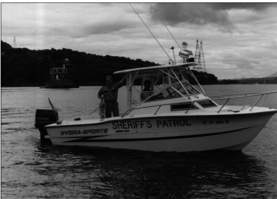
Rural patrol can include the Nation’s inland waterways.

Even less is known about rural-urban differences in child abuse, but two studies by the National Center on Child Abuse and Neglect 24 suggest the issue is worth further study. The first study was conducted in 1980 and the second in 1986. The studies differed in one important respect. In the 1980 version, abuse was defined as “demonstrated harm as a result of maltreatment.” 25 The 1986 study included a definition of abuse that mirrored the 1980 definition, but also in-