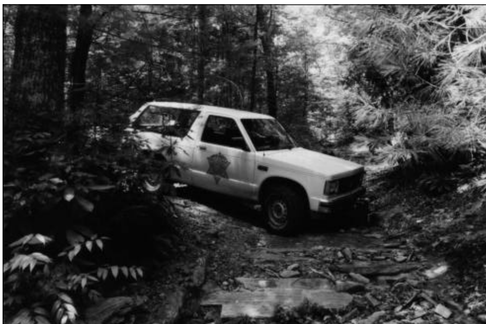
Officer encounters adverse physical conditions in isolated area.

Economic factors. High rates of poverty have long been associated with high rates of crime. Crime has been less frequent in rural areas, although poverty has been a common problem in rural America. For example, of the 159 high-poverty counties in the United States in 1979, only six contained a city with a population of 25,000 or more. 43 Further,