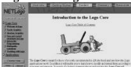
Figure 2: The main entry screen of the Logo core part

The initial idea behind the Logo Core was to meet the curiosity of those teachers who would like to lift the hood to see how the Logo applications work . Approaching the design of the Logo core from two different aspects (the emphasis being on the language versus the emphasis on the programming environment) we still had our chance as a team – the fresh rabbit was aware of the power of the language, and the old dog was not reluctant to learn the new "environmental" tricks . Finally we did it in such a way that the users would be able to voyage between the interface and the programming language and to do this with a learning goal in mind. The course is structured in six modules. We shall consider them from two aspects: the informatics topics (supposed to