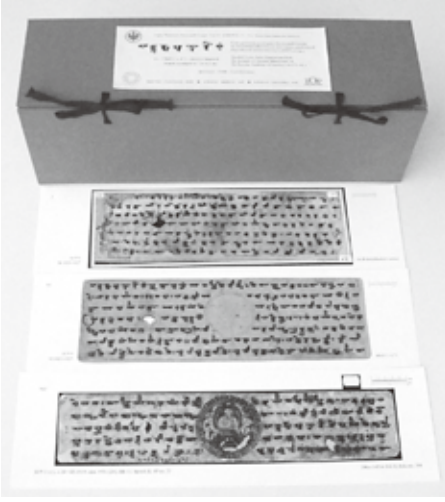
Sanskrit Lotus Sutra Manuscripts from the Institute of Oriental Manuscripts of the Russian Academy of Sciences, Facsimile Edition (2013)

appears to have been copied in Khotan.) * The Lotus Sutra manuscripts can be divided into the three lineages, namely, the Nepalese manuscripts, the Gilgit manuscripts, and the Central Asian manuscripts (or the two branches, the Gilgit-Nepalese and the Central Asian manuscripts), and the Petrovsky Manuscript is a representative of the Central Asian manuscripts. It is estimated to have been copied from the 9th to the 10th centuries and is an extremely valuable document